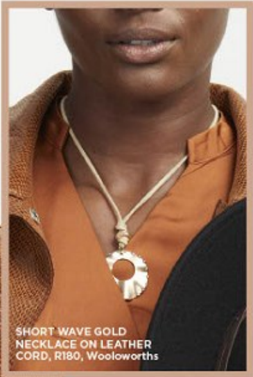
SHORT WAVE GOLD NECKLACE ON LEATHER CORD, R180, Woolworths

RUST BLOUSE, R599, Poetry | RUST COAT, R1 699, Miss Cassidy @Queenspark | RUST FOIL PRINT CASUAL PANTS, R399, Cathnic @Queenspark | BLACK HELENA POINTED BOOTS, R599, Rubi Shoes @Cotton On | GOLD BRACELETS, R120, Woolworths | BLACK WIDE-BRIM FELT HAT, R399, Cotton On