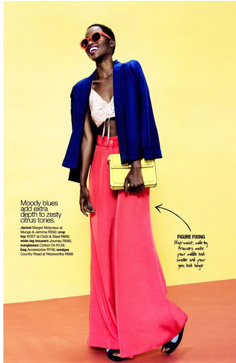
FIGURE FIXING High-waist, wide-leg trousers make your middle look smaller and your pins look longer

Jacket Margot Molyneux at Mungo & Jemima R550; crop top W35T at Cloth & Steel R800; wide-leg trousers Journey R590; sunglasses Cotton On R149; bag Accessorize R749; wedges Country Road at Woolworths R999