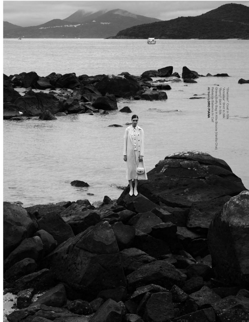
*Sherman Coat in Silk *Amalaka Shirt in Silk *Romy Shirt in Silk *Kara Badon (Versus Cui) *Rafaela Blouse in Cash All from LOHO PIANA