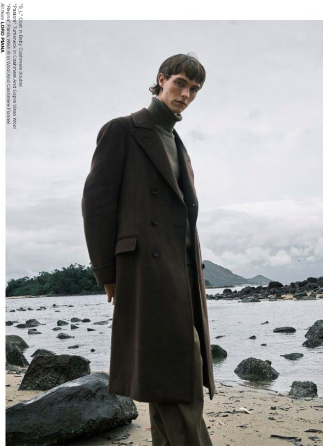
*S.L. Coat in Baby Cashmere double *Pastore Turtleneck in Cashmere And Super Viscose Wool *Rogent Pulis, Visk @ in Wool And Cashmere Flannel All from LOHO PIANA