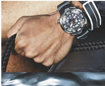
Rechts: BN7020-09E Eco-Drive Professional Diver 1000M, CITIZEN; 995 Euro - Jacke PRADA; 1300 Euro