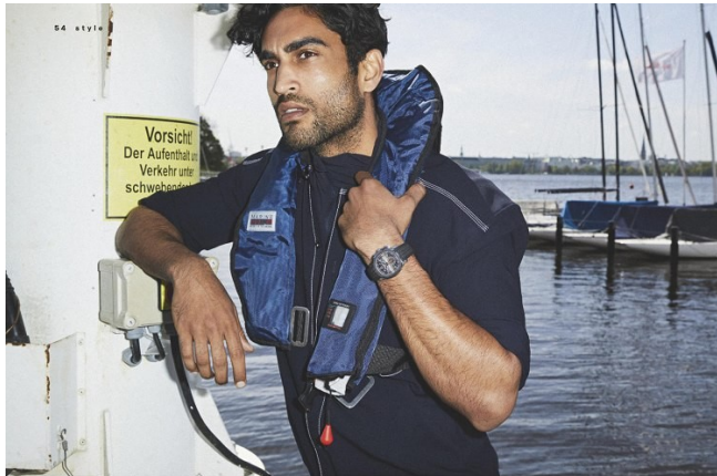
Oben: Aquanaut PATEK PHILIPPE; 20 200 Euro - Jacke BOSS; Preis auf Anfrage