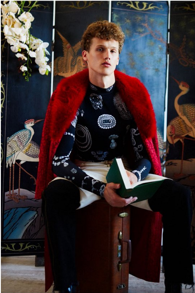
Abrigo: NARCISS Pantalones y camisa: LINDER Botas: CALVIN LUO