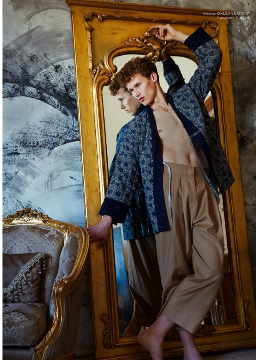
Kimono: KRAMMER & STOUDT Pantalones: NUBOUTE