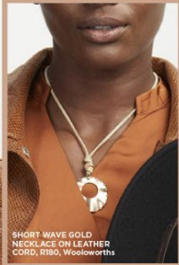
SHORT WAVE GOLD NECKLACE ON LEATHER CORD, R180, Woolworths

RUST BLOUSE, R599, Poetry | RUST COAT, R1 699, Miss Cassidy @Queenspark | RUST FOIL PRINT CASUAL PANTS, R399, Cathnic @Queenspark | BLACK HELENA POINTED BOOTS, R599, Rubi Shoes @Cotton On | GOLD BRACELETS, R120, Woolworths | BLACK WIDE-BRIM FELT HAT, R599, Cotton On