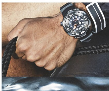
Rechts: BN7020-09E Eco-Drive Professional Diver 1000M, CITIZEN; 995 Euro - Jacke PRADA; 1300 Euro